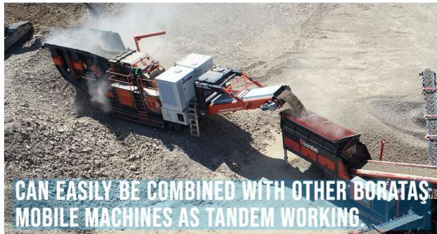
CAN EASILY BE COMBINED WITH OTHER BORATAS MOBILE MACHINES AS TANDEM WORKING.