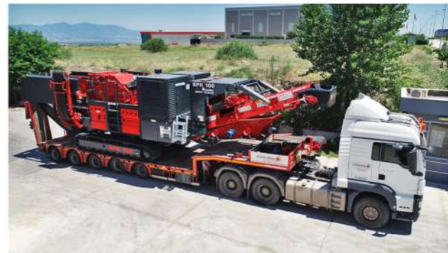
EASY TO TRANSPORT DUE TO FOLDABILITY